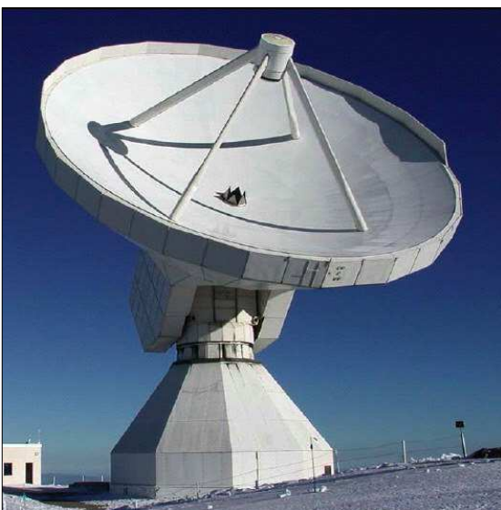
Figure 10. The 30-m millimeter telescope of IRAM at Pico Veleta.