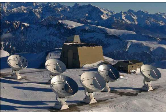
Figure 11: A recent view of the IRAM interferometer on Plateau de Bure, with its 6×15-m antennas. The large shelter in the background is used for antenna construction and maintenance.

enlarged to 800 m 2 ) for offices and laboratories which would served as the IRAM headquarters in downtown Granada. As compensation, the IGN would obtain up