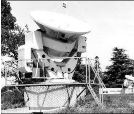
Figure 2: The 8-mm two-element interferometer at the Bordeaux Observatory in 1973.