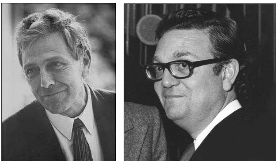
Figure 4 (left): Bernard Grégory (courtesy: Archives du CNRS ). Figure 5 (right): Pierre Creyssel (courtesy: Archives du CNRS ).