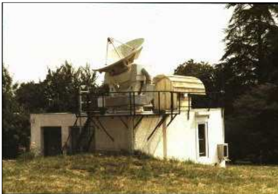
Figure 3: The 2.5-m diameter POM 1 antenna on top of its building at the Bordeaux Observatory; this antenna was previously one of the two elements of the interferometer shown in Figure 2.

In Germany, radio astronomy started thanks to the efforts of Leo Brandt (1908–1974), an electronic engineer and radar pioneer who became in 1949 the Secretary of State of Nordrhein-Westfalen. He initiated the creation in Stockert, near Bad-Münstereifel-Eschweiler, of a radio observatory equipped initially with a Würzburg antenna, and later with a 25-m diameter radio telescope, completed in 1956 (Menten, 2008; Wielebinski, 2007). The ownership of this Stockert radio telescope was shared by the University of Bonn and a research institute for high frequency physics. 1 It was one of the best steerable dishes at this time. After this success, the Volkswagen Foundation promised money in 1964 to build a larger radio telescope, and this stimulated the creation in 1966 of the Max-Planck-Institut für Radioastronomie (MPIfR) in Bonn. Otto Hachenberg (1911–2001), who had been teaching radio astronomy at the University since 1962, became the first Director of this Institute, and the Stockert radio telescope became his responsibility. The new instrument financed by the Volkswagen Foundation was the 100-m Effelsberg radio telescope, which was completed in 1972 (Hachenberg et al., 1973; Wielebinski et al., 2011). Thanks to these radio telescopes, Germany acquired expertise in the design and construction of large steerable dishes, while France