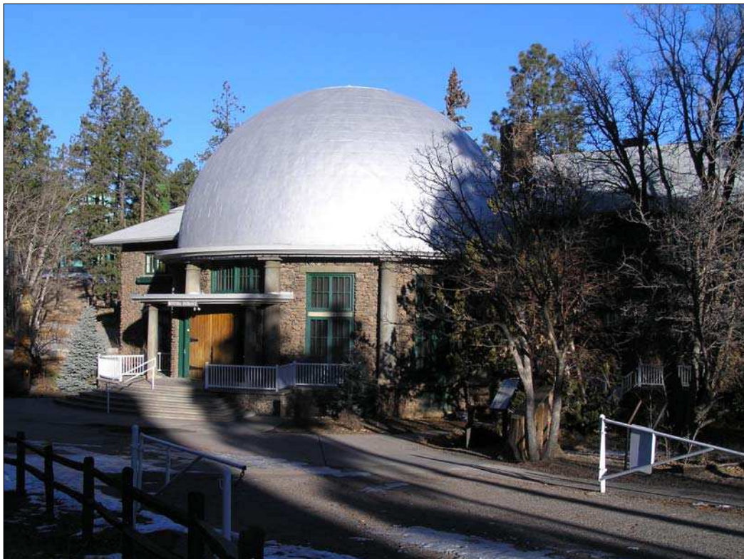
Figure 7: A recent view of the Slipher Building at the Lowell Observatory.