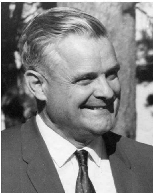
Figure 6: John S. Hall (1908–1991) was at the Lowell Observatory from 1958 to 1977 (Director: 1958–1977) (Photograph courtesy Lowell Observatory Archives).

Since Hall wanted to finish some projects at USNO, the effective date of his appointment was put off to 1 September 1958.