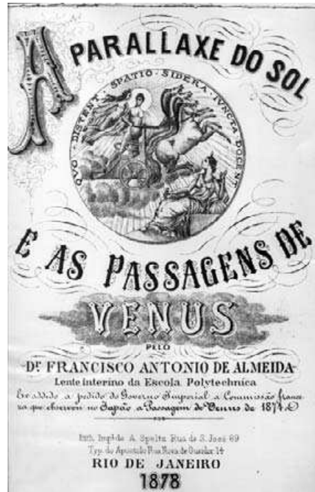
Figure 5. Frontispiece of the first book published in Brazil on the parallax of the Sun and the transit of Venus by the Brazilian astronomer Francisco Antônio of Almeida.

not vital; it doesn't have practical results to any human comfort or social interest, and it doesn't only depend upon the transit of Venus. Laplace already had made by the movement of the Moon; Priest Secchi refers to the process of speed [note of the author] of the light. There are more than ten or twelve processes to come to the foreseen result; and many authorities in the matter assured that none of them is evident and for sure. Consequently, it is a very problematic interest, even in the deep abstract root of science, however that we will put on an amount of money that has nothing of abstract, it is very positive (laughs)." (Annals of the Parliament, Section of March 22 of 1882, p.7).