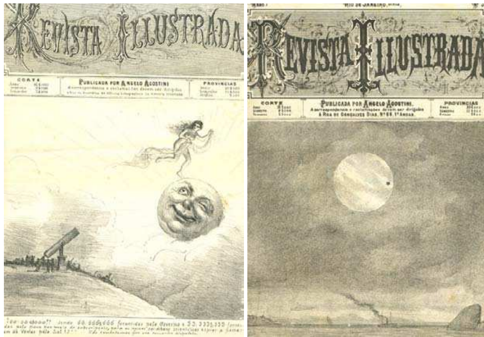
Figure 6. (Left panel) Frontispiece of Revista Ilustrada of 10 December 1880 by Ângelo Agostini (1843–1910) criticizing the budget expenditure directed to the observation of the transit of Venus by the solar disk. (Right panel) Frontispiece of Revista Ilustrada of 7 December 1882 by Ângelo Agostini (1843–1910) criticizing the difficulty in observing the transit in Rio de Janeiro, because of the foggy and rainy weather.

for the observation of the passage of Venus in 1874 in Nagasaki, in which the Canadian astronomer Simon Newcomb (1835–1909) participated. For the transit of 1882, the Congress of the USA approved a budget of US$85 000 without any political opposition, in spite of several astronomers' objection regarding the importance of the mission. Among them was Newcomb who had participated in the 1874 mission in Nagasaki. Once the resource was approved, he agreed to lead the mission to Wellington, South Africa, although he believed that the funds could have given better results with some other objectives. Several scientific bulletins with astronomy and natural history results were presented by Emperor Dom Pedro II to the Academy of Sciences at Paris for the Brazilian scientists.