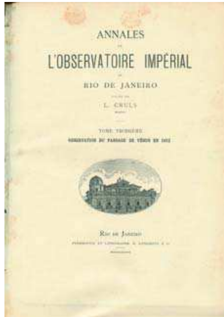
Figure 7. Frontispiece of the “Annals of the Imperial Observatory of Rio de Janeiro”, published by Luiz Cruls, exclusively dedicated to the observation of the transit of Venus in 1882.

the planetary distances. In 1974, the International Astronomical Union adopted the solar parallax of 8''.794148 \pm 0''.00007 ( 149\,598\,870 \pm 1\,000 km), the average value determined by the USA, USSR and England through radar measurements at the beginning of the 1960s. In 1976 the International Astronomical Union adopted the value 149\,597\,870 \pm 2 km, obtained based on the light travel time by unit of distance.