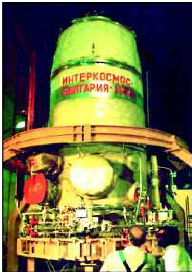
Figure 3: First Bulgarian Satellite "Bulgaria 1300" launched in 1981.

program for the second manned flight with a Bulgarian astronaut. Under the "Shipka" Program, research teams from the Bulgarian Academy of Sciences, Sofia University, the Academy of Agriculture and other universities and institutes were engaged in the implementation of more than 48 research experiments in the field of space physics, remote sensing of the Earth from space, space biology and medicine, space material science, space equipment. The flight took place in 1988 with astronaut Alexander Alexandrov (Fig. 4). The leading research institute in the implementation of the "Shipka" project was SRI - BAS. For the implementation of this research program the Bulgarian scientists designed 15 research devices and complexes which continue to work even after the Bulgarian flight as part of the equipment on the Russian MIR Orbital Space Station. In parallel with the preparation of this flight, scientists from SRI participated successfully in the international programs VENUS-HALLEY (1985-1986), PHOBOS (1988-1989), AKTIVEN (1989), APEX (1990) (Fig.5).