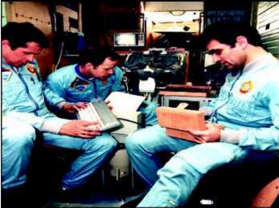
Figure 4: The second Bulgarian astronaut Alexander Alexandrov with his russian colleagues.

In the recent years, in the SRI, new programs are elaborated and a number of old programs and complexes are improved, such as: the SVET space greenhouse, the R-400 very high frequency (VHF) radiometer under the PRIRODA project, the NEUROLAB-B system for monitoring the astronauts' psychophysiological status which were flown and operated on board of the MIR orbital space station.