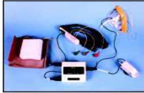
Figure 6: The "Neurolab-B" system. Figure 7: The "Holter" system.

Onboard of the MIR OS were carried out the experiments under the SVET SG space greenhouse project (Fig. 8) with the active participation of Russian and American astronauts during 1990-2000 are as follows: two-month experiments with radishes and Chinese cabbage - June-August 1990; three-month "Super Dwarf" wheat experiments - August-November 1995; six-month wheat experiments with two successive wheat crops - July, 1996 - January, 1997 (with the Utah State University, Logan, USA); four-month experiments with three "Brassica Rapa" generations - May - September, 1997 (with the Louisiana State University, USA); six-month experiments with two successive crops of a new wheat brand - November, 1998 - May, 1999; and three-week experiments with leaf crop - May - June, 2000 (with the IBMP, Moscow).