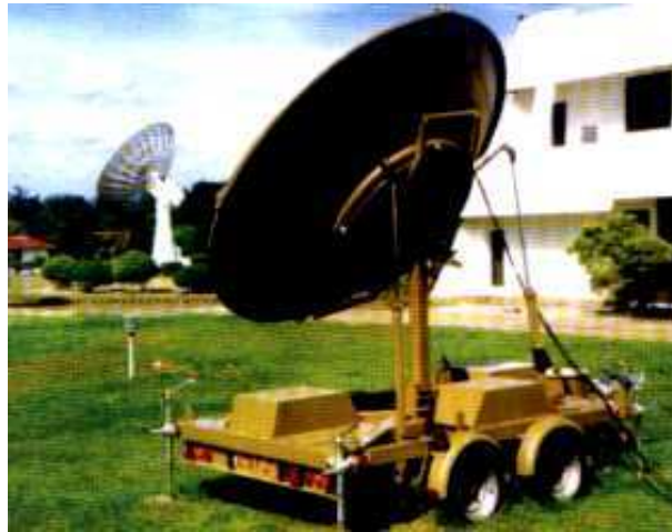
Figure 9: The mobile ground receiving station "RAPIDS".

During the project RAPIDS joint workgroup of specialist from NLR and Space Research Institute was formed. An demonstration scenario was developed and coordinated according to the proper test areas concerning schedule activities. The mobile ground receiving station RAPIDS was transported and installed near to the Space Research Institute in Sofia in 22-29 of September 2000. Bulgarian partners have organized a model of Receiving and Processing Center for remote sensing data. As result of the work were received optical (SPOT) and radar (ERS) data.