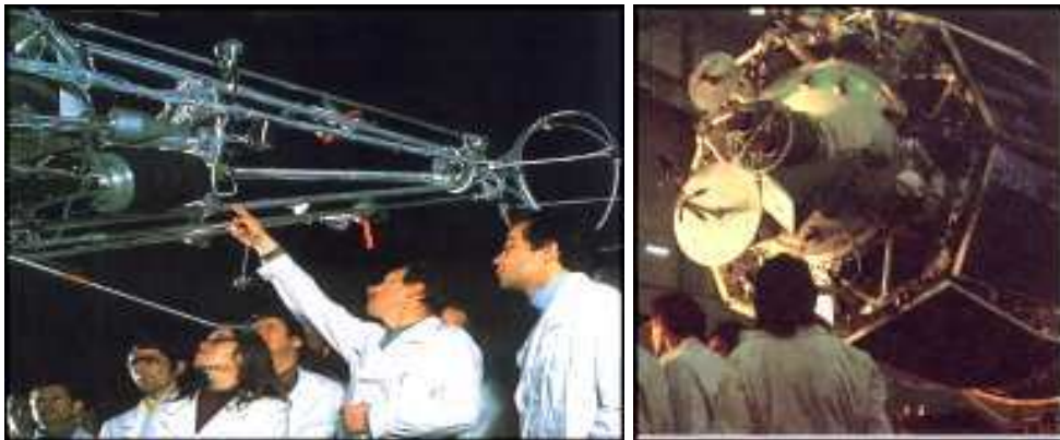
Figure 1a,b: Bulgarian scientists during the preparing of the INTERCOSMOS experiments.

In 1972, after launch of first Bulgarian equipment P-1, Bulgaria became the 18th in order space country.