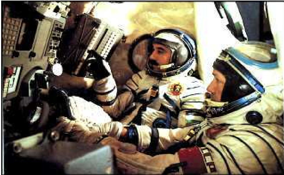
Figure 2: Astronauts Georgi Ivanov (BG) and N. Rukavishnikov (USSR) on board of SOYUS-33.

In 1981, through the two satellites INTERCOSMOS "Bulgaria - 1300" (Fig.3.), furnished entirely with Bulgarian equipment, and METEOR - PRIRODA, the National Space Program "Bulgaria-1300" was implemented, aimed at studying the ionospheric-magnetospheric relationship and remote sensing of the Earth from space. These successful experiments consolidated the priority scientific and scientific-application research areas in the country - space physics, remote sensing of the Earth, and space technology.