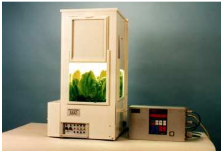
Figure 8: The "SVET SG" - first space greenhouse successfully tested at MIR OS.

The project is discussed by the international scientific community which qualifies it as one of the most prestigious ones, carried out in the 1990s on the MIR OS. Plant experiments will continue in the next 21st century on the International Space Station, for which a new generation of SVET-3 SG is being designed, along with similar NASA and ESA equipment.