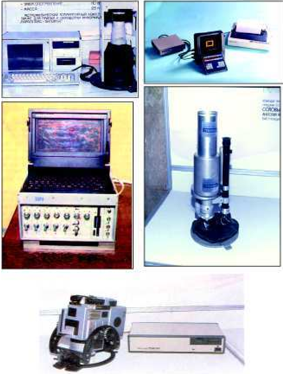
Figure 5: Space equipment made at the SRI, BAS and used during different space missions.