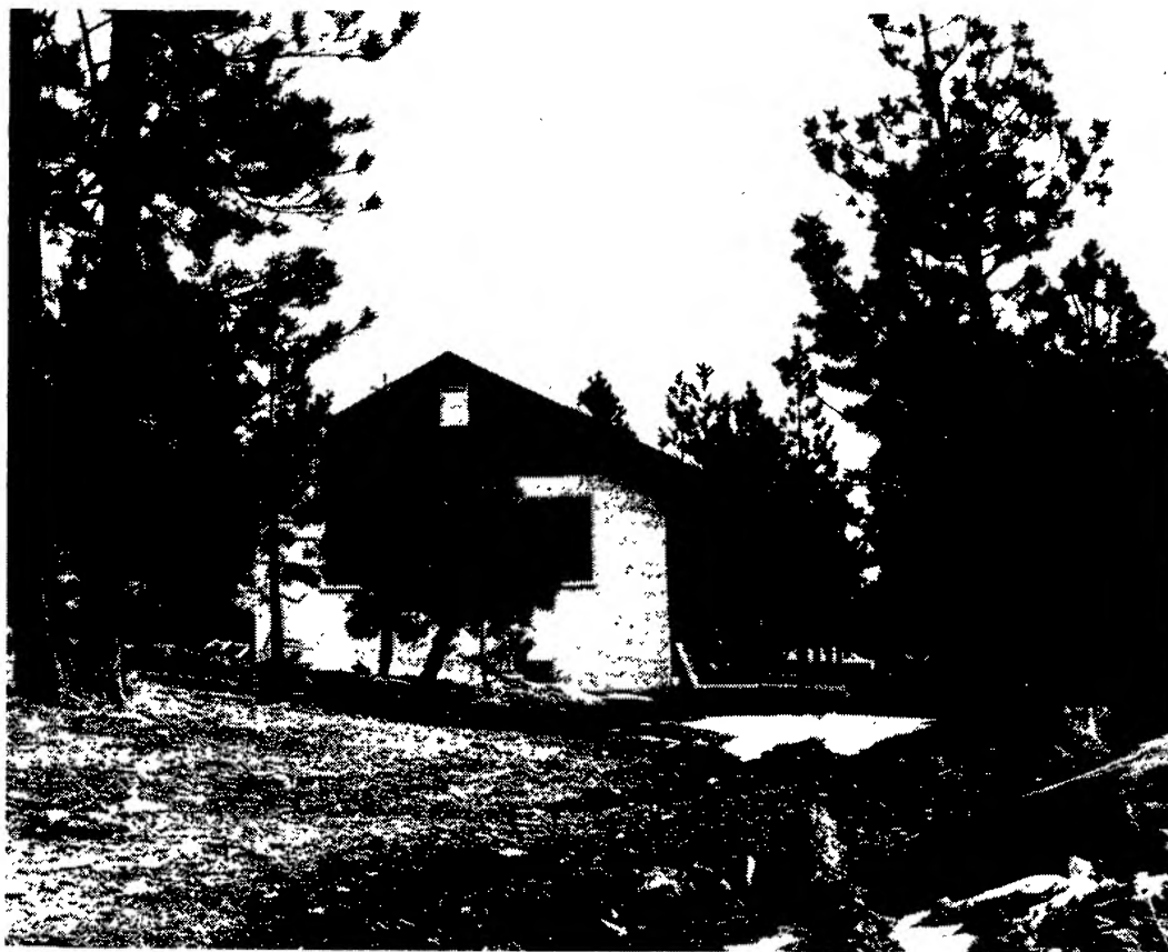
PLATE II Residence at the Pine Mountain Observatory

A 20 × 52-foot residence (see Plate II) provides comfortable living quarters for the professional staff and night assistants. A night observer and caretaker, Mr. Martin McCoy, lives year round at the observatory. A 17,000-gallon cistern and pressure pump supplies water for the observatory and residence. Electric power is furnished by the Central Electric Cooperative of Redmond. The power cable was laid underground for 20,400 feet from a transformer near a well at the north base of the mountain. This underground feature prevents power interruptions due to falling trees or snow. Telephone communication is provided by Pacific Northwest Bell Telephone Company. This consists of a microwave link (2 GHz) with one antenna on the mountain and the other 30 air miles away in Bend. This facility is capable of 24 channels of simultaneous communication.