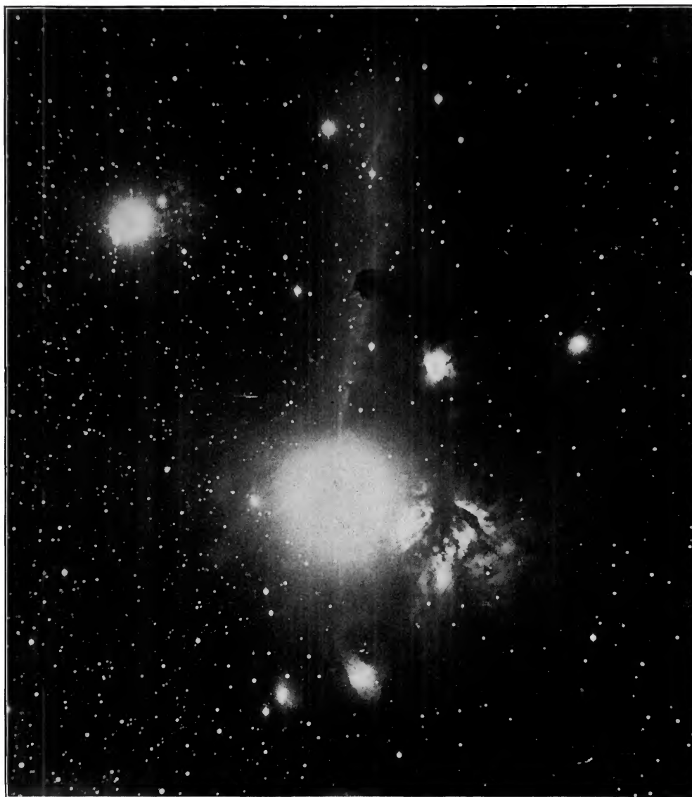
NEBULÆ AROUND \zeta ORIONIS (January 25, 1900).